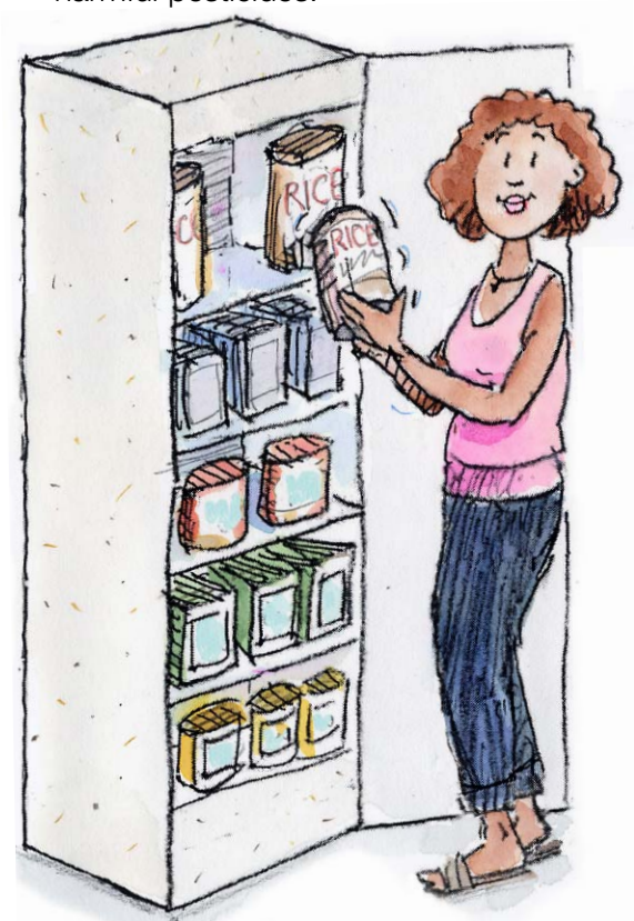
Store open foods, such as cereal, flour and rice, in containers with a lid.