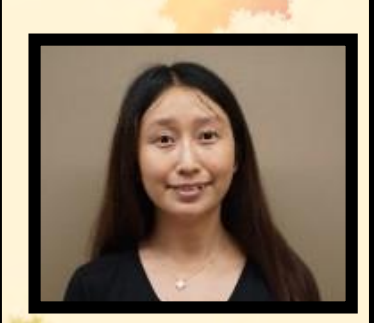
Undeclared Writer I love reading novels and once I wrote a novel with my friend based on her name. It is amazing to look