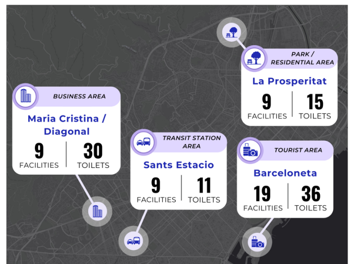
Figure 1. Barcelona Site Map with Toilet and Facilities Findings