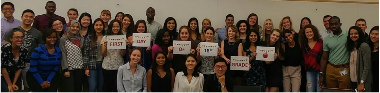
The MHA Class of 2017 in September celebrating their last first day of school