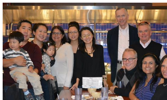
Exec Class of 2008

The EXEC class of '08 hosted a gathering in October for classmates and their families. The class has been meeting twice a year since their graduation in 2008.