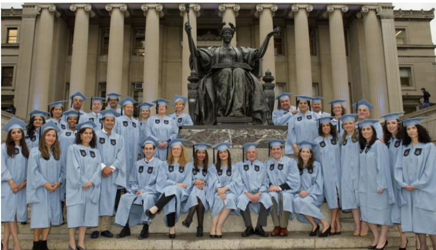
The EXEC Class of 2016 at their commencement ceremony in October