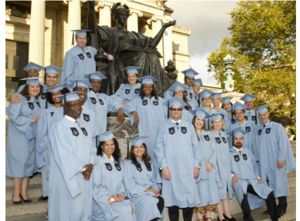
EMPH Class of 2014

Contact HPM to share your updates: Email Carey McHugh: ctm2101@columbia.edu