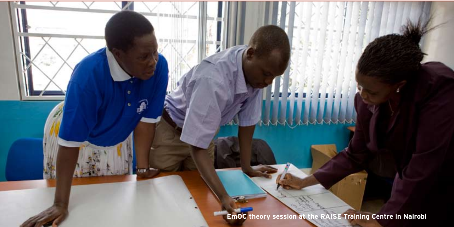
EmOC theory session at the RAISE Training Centre in Nairobi